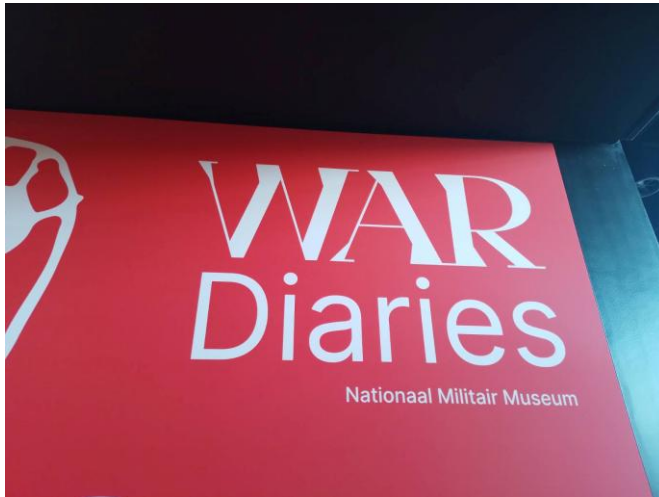
War diaries exhibition. National Military Museum Soesterberg, The Netherlands

A reminder of this is the exhibit in the War Diaries section at the National Military Museum