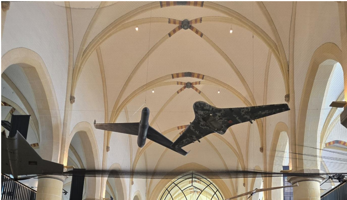
Close to the war exhibition. The National Museum of the 80 Years' War